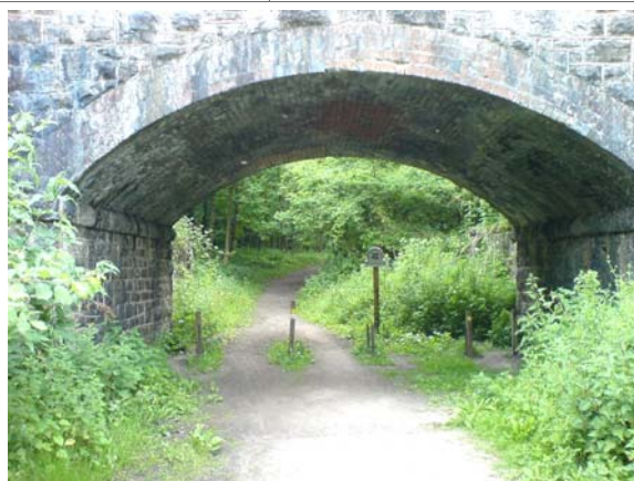
Start of Nightingale Valley